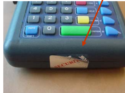
Figure 5C: After removal of security seal.